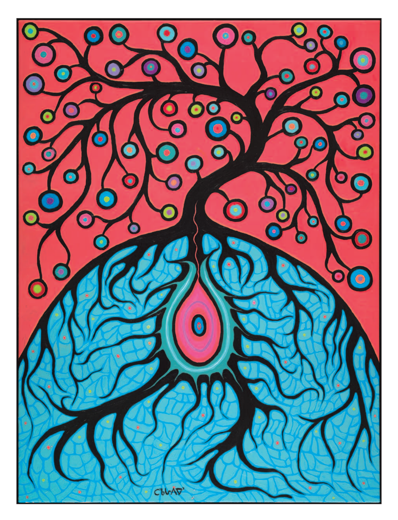
Tree of Life by Donald Chrétien, 2013 © Copyright

The ever-growing tree of life with its branches spread from east to west, the top to the north and roots to the south. It provides a link between the heavens, earth and underworld. It roots itself in the underworld, its trunk passes through the natural world